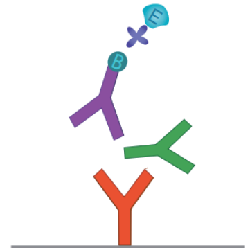
Total Ig ELISpot